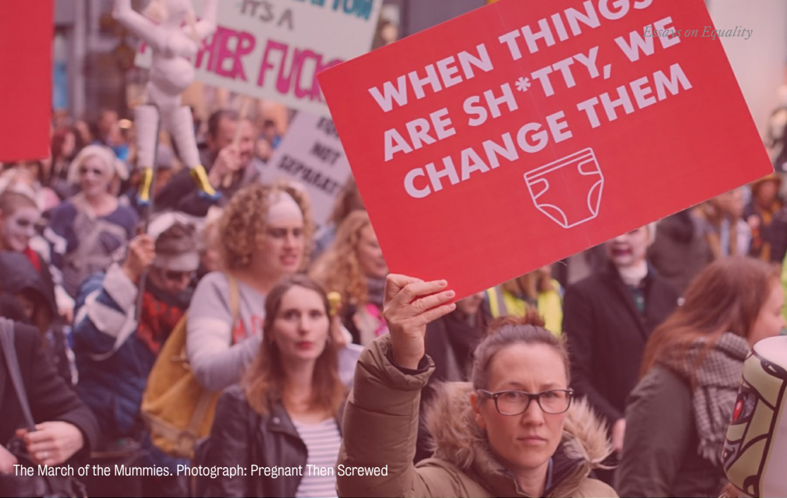
The March of the Mummies.

3 in 4 mothers experience discrimination in the workplace