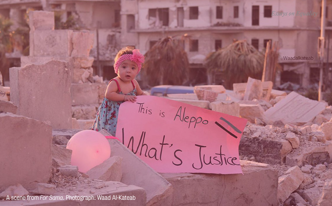
A scene from For Sama .

terrified of losing the baby as much as I was scared of giving birth inside the siege.