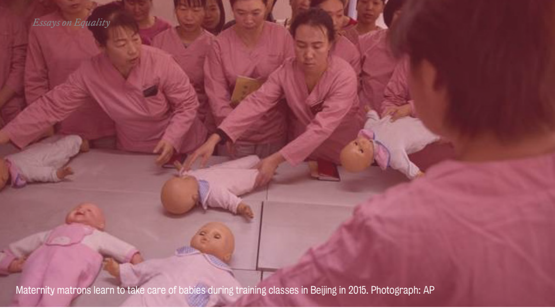
Maternity matrons learn to take care of babies during training classes in Beijing in 2015.

A major driver of pregnancy-based discrimination is that companies do not want to take on an employee who might be absent during the three to six months of maternity leave, and the costs associated with hiring a replacement. Mothers in China have much longer mandatory parental leave than fathers – and in some regions, fathers have none at all. 9