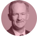
John Penrose MP Conservative MP and co-Chair of the Commission on Childcare

The UK's childcare problem is wearily familiar to everyone. Whether it is provided for free by a non-or-part-time working partner, grandparents or friends, or from a paid-for service by a nursery or other childcare professionals, any parent with not-yet-independent children who doesn't want to put their career on hold needs access to it if they want to avoid being trapped under a particularly thick glass ceiling. A ceiling which means they are unable to work a few extra hours to improve their pay or apply for a promotion, or switch to a sector with more travel or longer and less-predictable hours if it conflicts with their caring responsibilities.