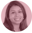
Tulip Siddiq MP Shadow Economic Secretary to the Treasury

As far back as I can remember, there are two things I always wanted – a baby sibling and, growing up in a politically charged family, to work in politics and make a difference. I was granted my first wish when I was eight years old and to my mother’s credit, she let me fuss, bathe, play and dress up my baby sister as much as I wanted. Years later this translated into my desire to have my own children and I’m now a happy, albeit overwhelmed, mother of two small children.