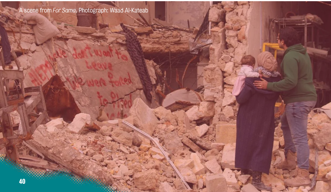
A scene from For Sama.

As with every Syrian baby who was born in Turkey, she had no formal papers and the only one I had was from the hospital, stating the birth of a healthy girl – albeit nameless. We put enormous effort into trying to register her at the Syrian embassy in Istanbul, and back in Syria through a lawyer, and other ways too. But there was no