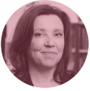
Rachel de Souza Children's Commissioner for England

It is astonishing how one year can change the way we view family. My recent Family Review , which examined family life across the UK, shone an exciting new spotlight about what family means in the 21 st century, how the events of the pandemic have shifted the way that children interact with the people and world around them, and how we care for the young in our society.