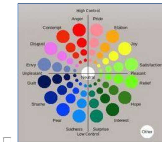
Figure 2: The Geneva Emotion Wheel

While computing power will increase, new algorithms may improve, and wearable devices will become smaller and more efficient at measuring response, the validity of affective computing will in some ways still have to do with the theories that are used to correlate physiological indexes to their emotion explanation. 73 Many measurement systems use a two dimensional arousal and valence scale. Sometimes a third category ‘dominance’ is also used to express the strength of the emotion, or in some categorizations ‘control’, how much control the person expressing emotion feels with regard to an event, is a variable paired with valence as in this emotion wheel.