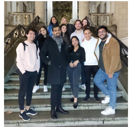
Current GeogSoc committee

represents over 600 students and offers social and career activities to support students during their studies.