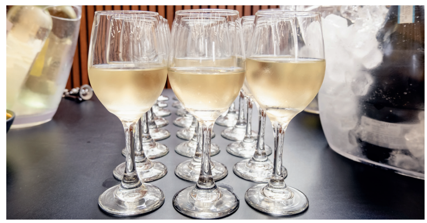
Menu & prices valid until 31st August 2025