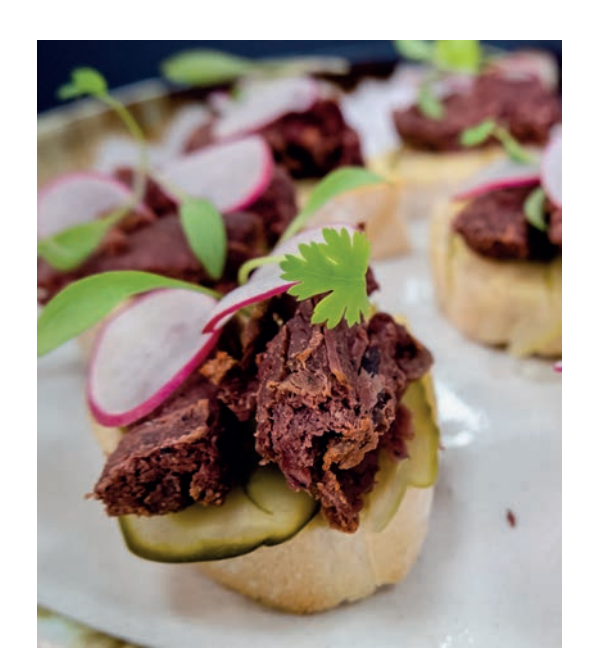
Menu & prices valid until 30th March 2025